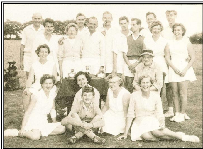
Club members 1958

Members were required to assist with the upkeep of the two courts and in 1962 a third one was added.