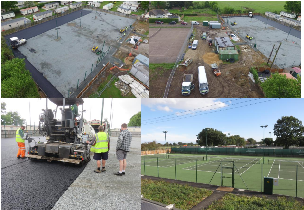
The new courts being laid and finished & colour-coated

Work had commenced in January 2017 but, due to wet weather, was suspended for three months. Restarting in April the courts were ready for use by June although the colour coat finish was not applied until September.