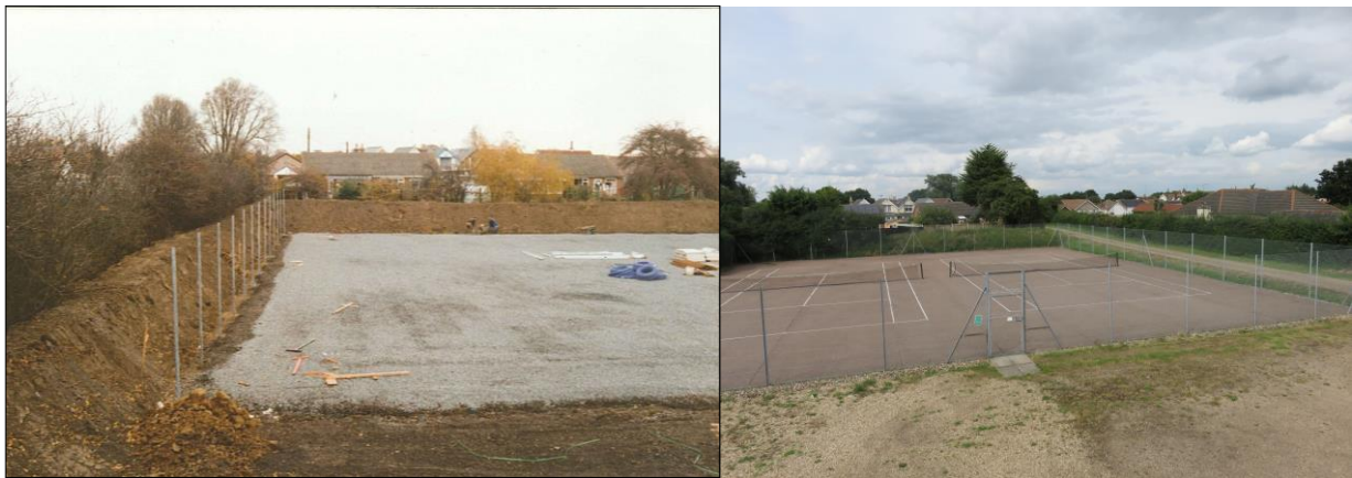
The hard courts under construction and completed in 1991

In 1991 two hard courts were constructed and, in 1998, the garden of the property next door (to the left) was purchased with the intention of constructing a third hard court.