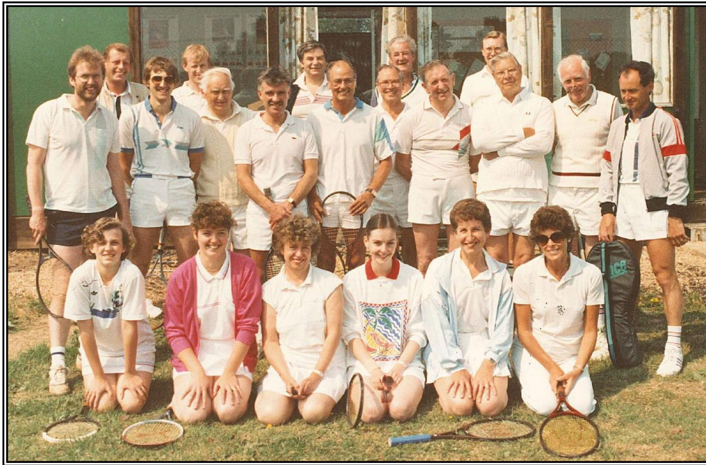
The members on the official opening day in May 1989

In all over £20,000 was raised to buy the land and prepare it for use. Works included the sewer connection, land drainage, electricity supply and moving the Clubhouse from the old site. In April 1989 play commenced at the new site on four grass courts.