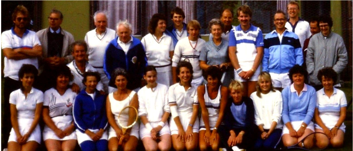
Club members – American Tournament 1986

In 1971 Clacton Tennis Club announced that their club would be folding and contacted Whitegates TC to ask if several of their members could join. Clacton TC had played for many years on the courts of the Oulton Hall Hotel in Church Road but were evicted when the hotel closed and the land converted to flats.