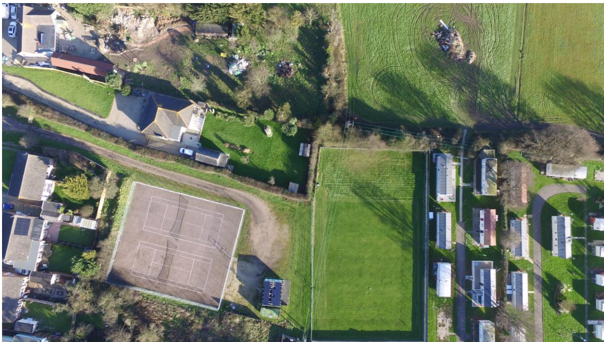
Ariel photo showing the four grass and two hard courts taken in 2000