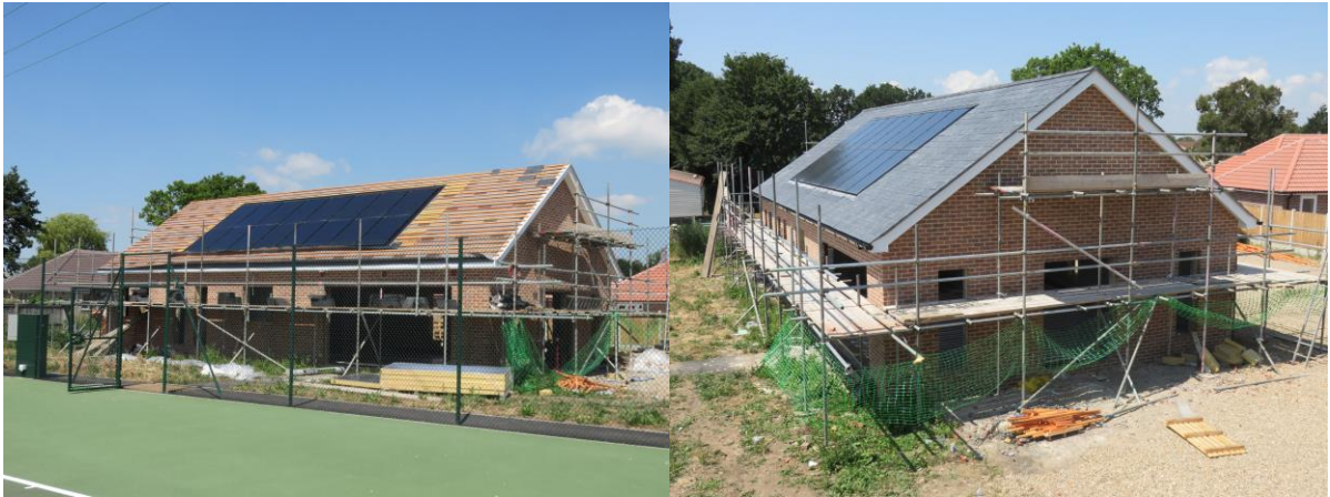
The building came into use in September 2018 & the car park was finished in January 2019