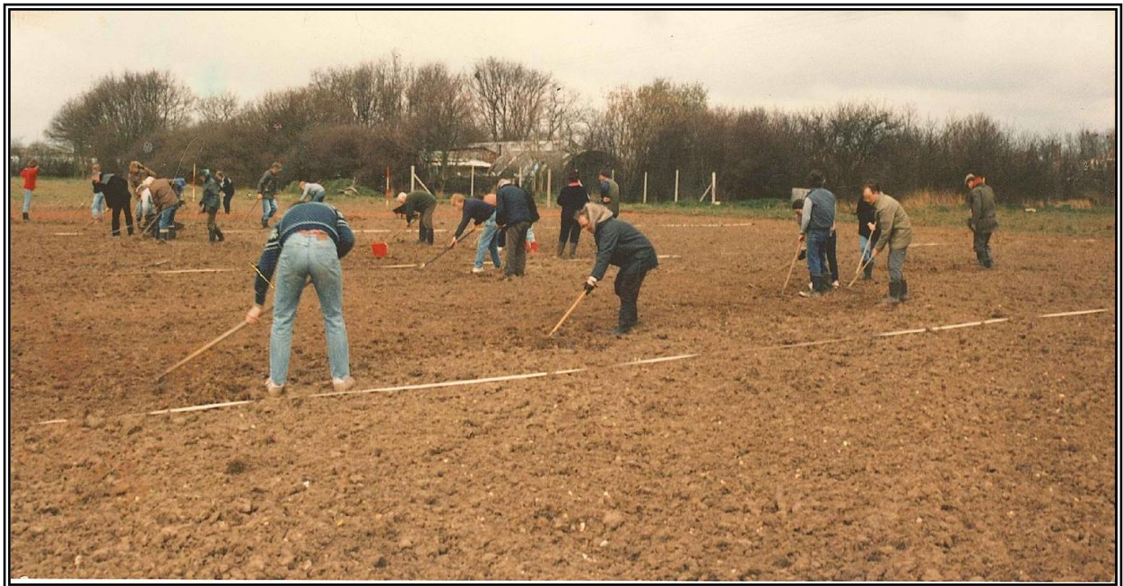
Members helping to level the grass court area prior to seeding in 1987