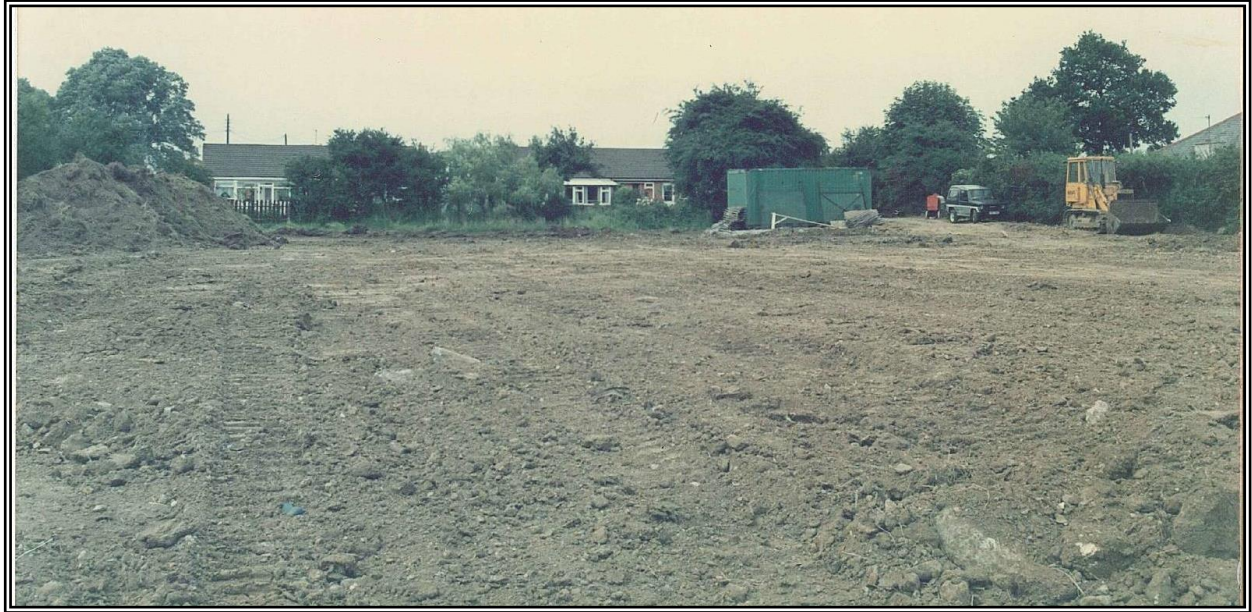
The site being prepared for tennis courts in 1987

A number of suitable alternative locations had been identified but one, in Holland Road, Little Clacton that had been part of the proposed Eastern route of the Little Clacton By-Pass became available for purchase and, after submitting a joint bid with the adjacent Firs Caravan Park who wished to have part of the holding as an extension to the camp, the Club took possession of 1.3 acres in September 1986.